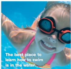
The best place to learn how to swim is in the water.

5516 Spring Garden Road • 4th floor • Halifax, Nova Scotia • B3J 1G6 • Tel: 902-425-5450 Ext. 331 • Fax: 902-425-5606 Email: experts@lifesavingsociety.ns.ca • Website: www.lifesavingsociety.ns.ca